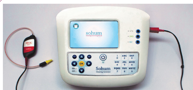
Figure 1 SOHUM hearing screening device, an artificial intelligence-driven low cost innovative diagnostic solution.

Sohum hearing screening device ( Figures 1 and 2 ) was developed to address concerns of low diagnostic accuracy, and of requirement of noise proof rooms and of skilled health workers. It is portable and compact, easy to use device. The technology uses selective artefact rejection that eliminates use of sedatives and enables usage in noisy environments. Moreover, the underlying technology is based on a reusable, easy to clean electrode system. Its artificial intelligence-driven unique algorithm provides high sensitivity and specificity, well-proven in clinical trials. Sohum hearing screening test has an optimized design that reduces test duration by minimizing time for preparation and analysis, and